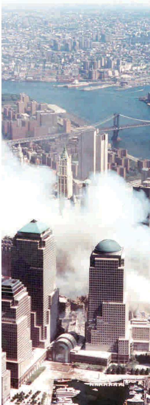
Office of Emergency Management

The Sept. 11 terrorist attacks and their immediate aftermath were one of the biggest breaking stories AP has ever covered. As one stunning event succeeded the next, AP broke developments to its members in two flashes, 25 APNewsAlerts and 18 bulletins in the first day.